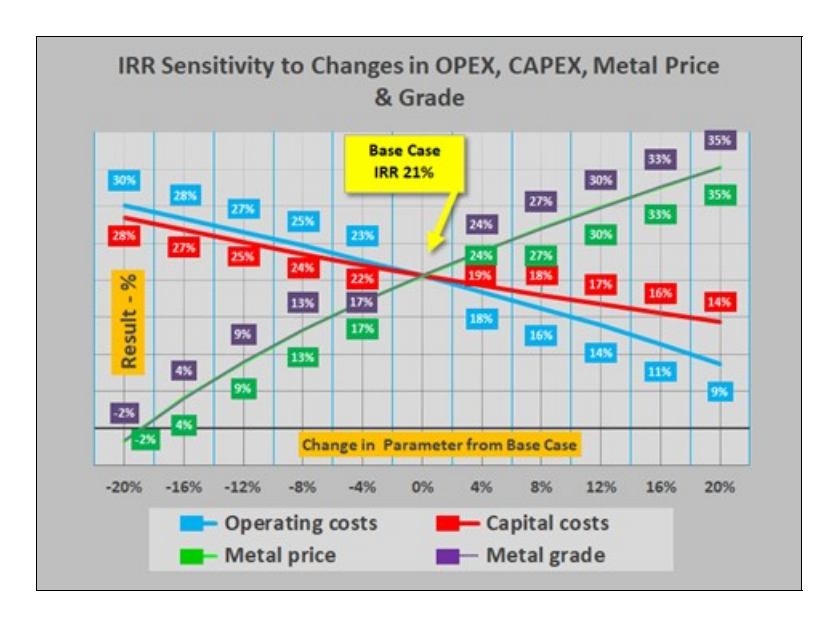
Figure 1-3: IRR Sensitivity